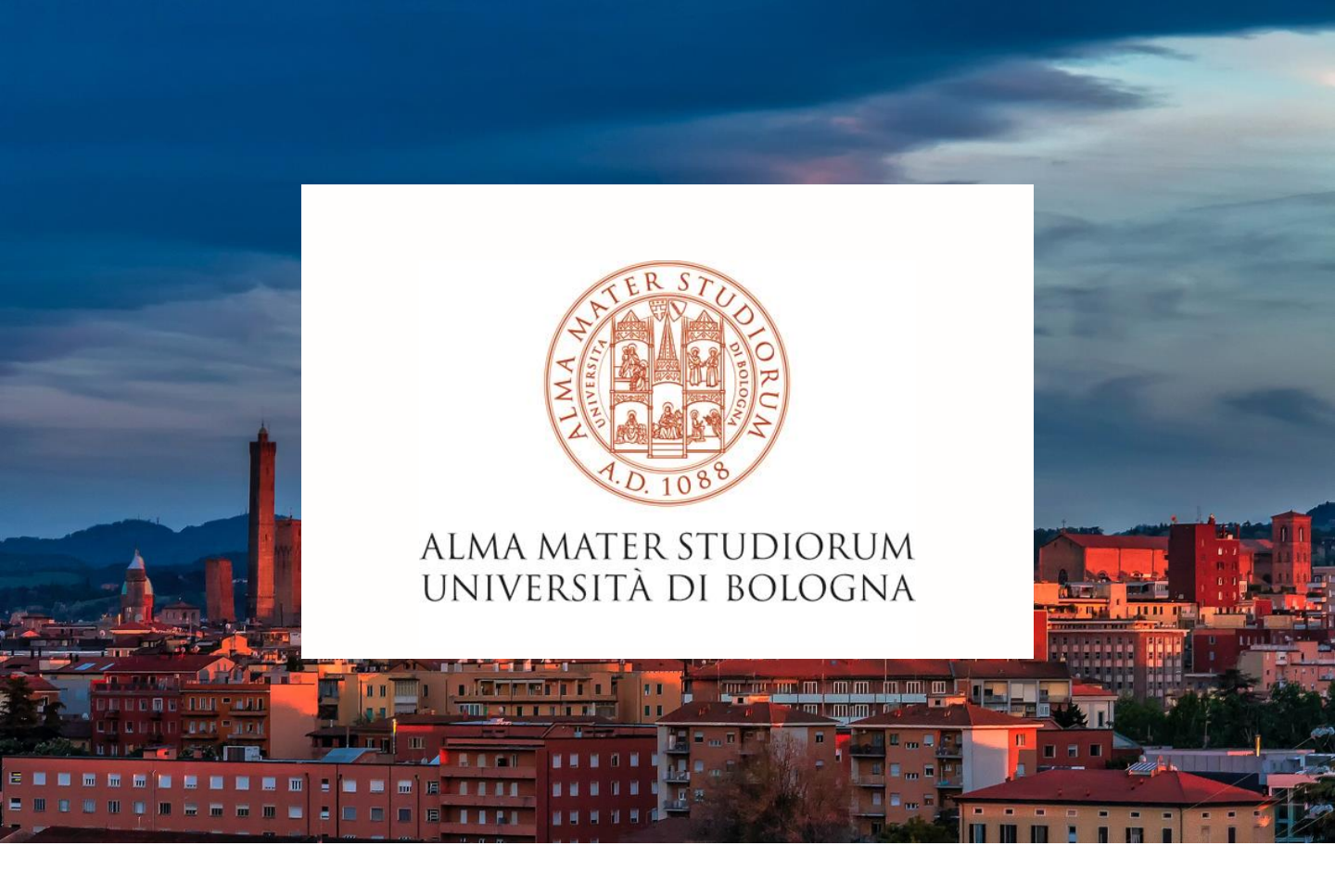
Header image created by <u>UIIN</u>, background photo by @sterlinglanier on <u>Unsplash</u>, logo by <u>UNIBO</u>