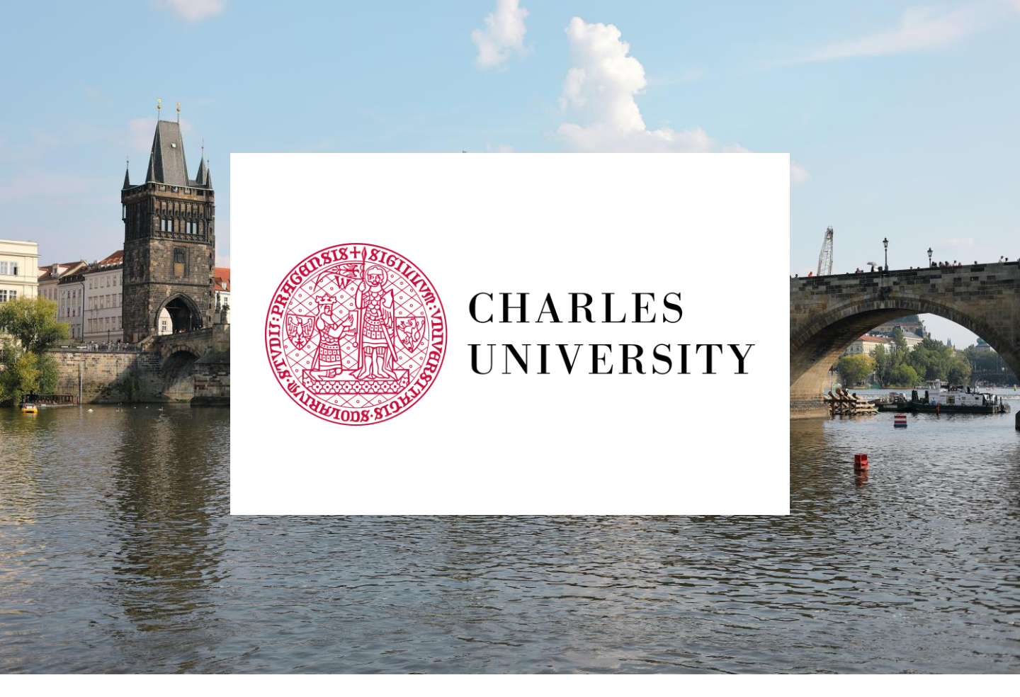
Header image created by UIIN, background photo by @maksimshutov on Unsplash, logo by CUNI